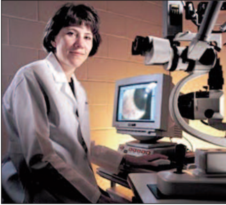
Distance Live Eye Exams

utilities. FTTP is local—it's the last telecom mile—and it must be owned locally to ensure that community needs are met. There will be naysayers. But, please excuse the cliché: Where there's a will, there's a way.