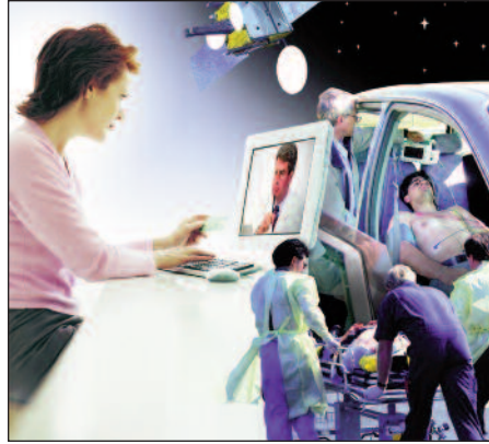
Telemedicine Transport Emergency Treatment

At the heart of the high-speed Internet void is the issue of public versus private ownership of essential telecom infrastructure. The private sector can't afford, nor make the business case to stockholders, to universally deploy fiber-to-the-premise networks. Government can no longer