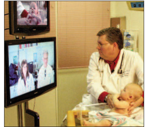
Telemedicine Model Distant Pediatric Specialist Diagnosis

The current economic crisis forces the country to embark on a massive infrastructure reinvestment program to create jobs. This is the perfect time to transform management of public-rights-of-way, telecom and electric assets so they will be secure, affordable, and universally available throughout this century. Launching JULIET and moving electric and telecom lines underground will be a costly, politically contentious effort in the short term—but long term, the